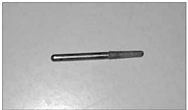
Figure 3 Dental burr