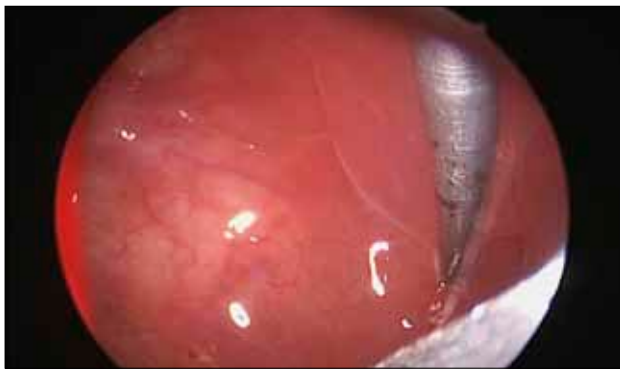
Figure 2 Left maxillary sinusoscopy: dental burr and thickening of the sinus mucosa